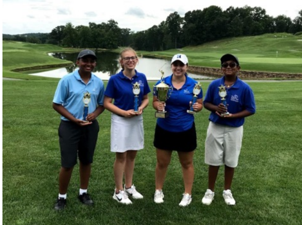
Summer: Metro Tour and Mentor