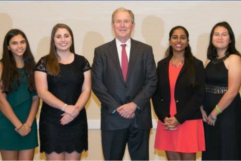
With Honorary Chair, President George W. Bush