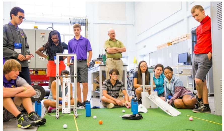
Model Testing at USGA Headquarters. Far Hills, NJ