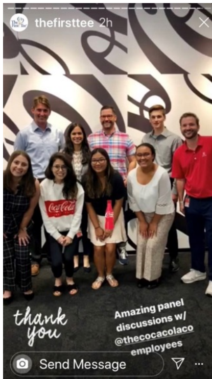
Scholarship interviews at Coca Cola