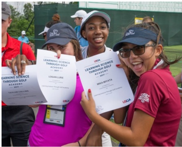
USGA Learning Science Through Golf Academy.