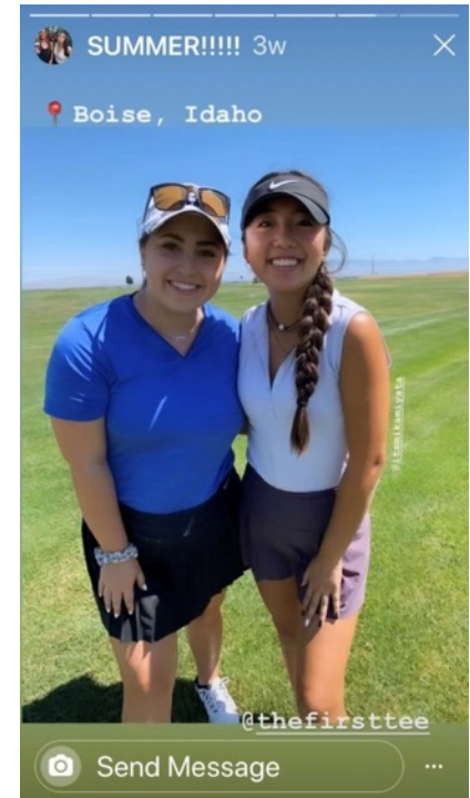
New friend made at Life Skills