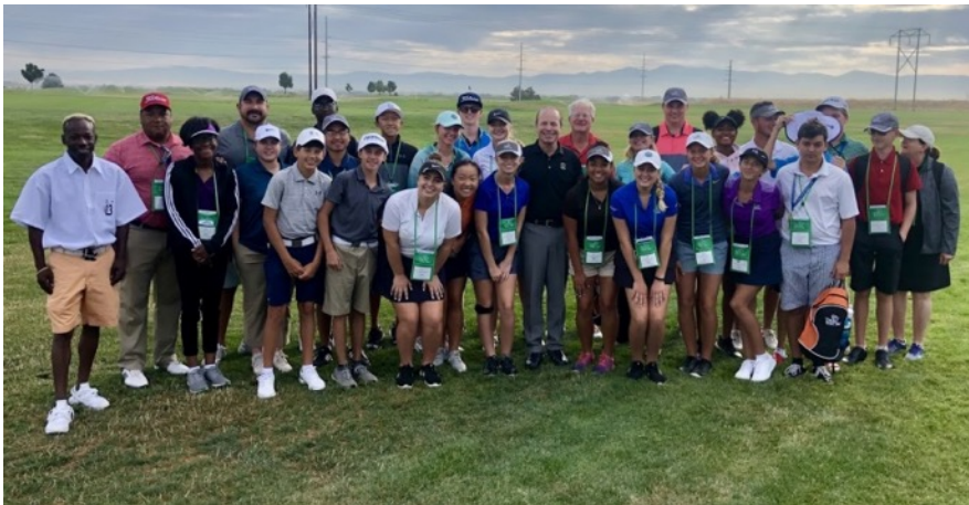
Day of golf in Boise, ID