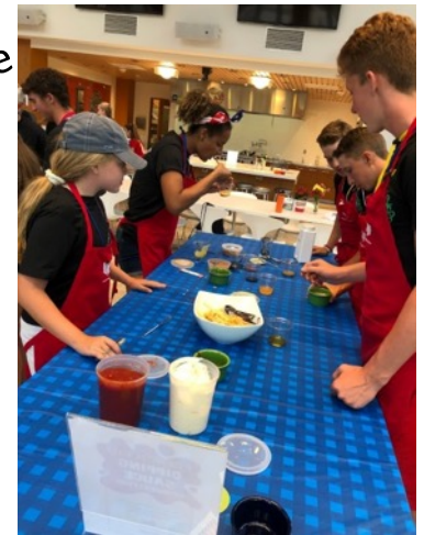
French Fry "Sauce" Challenge