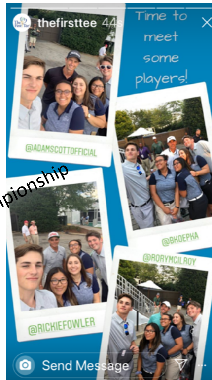
VIPs at Tour Championship